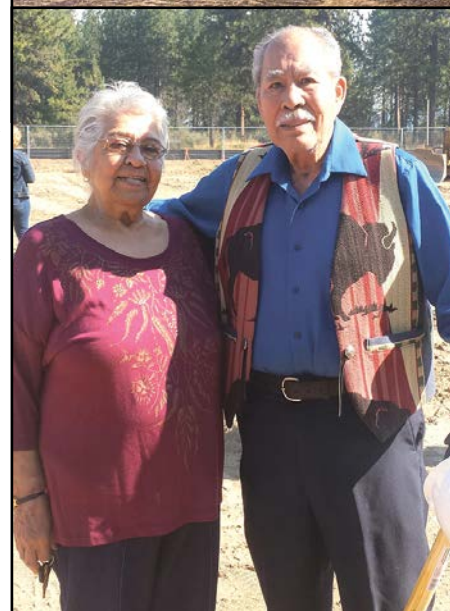
Visitors gather at the site location while the White Sage Drum gets ready to bless the ceremony with their music and prayers.