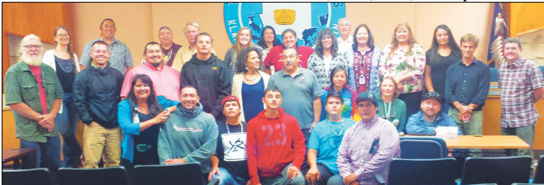
Rios to Rivers Youth with Klamath Tribal Council, The Klamath River Keeper Board, and Youth from Chile' the Klamath, Karuk, Yurok, and Hoopa Tribes.

Chiloquin, OR- From July 10-13, 2017, the Youth from Patagonia, Chile' and the Klamath River Tribes (Klamath, Karuk, Yurok, and Hoopa), along with community youth, were in the homelands of the Klamath Tribes. The Rios to Rivers Cultural Exchange toured the Klamath Basin and the Klamath River over a 3 week period, to share the Chile' youth's experience opposing proposed dams in Chile (which are owned by the Corporations). They will tour from the headwaters (Klamath Tribes) along the entire river system of the Klamath River... thru the homelands of the Karuk, Yurok, and Hoopa tribal people.