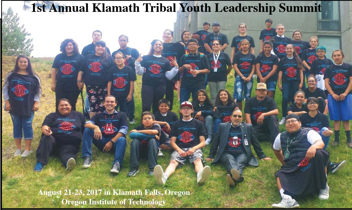
August 21-23, 2017 in Klamath Falls, Oregon Oregon Institute of Technology