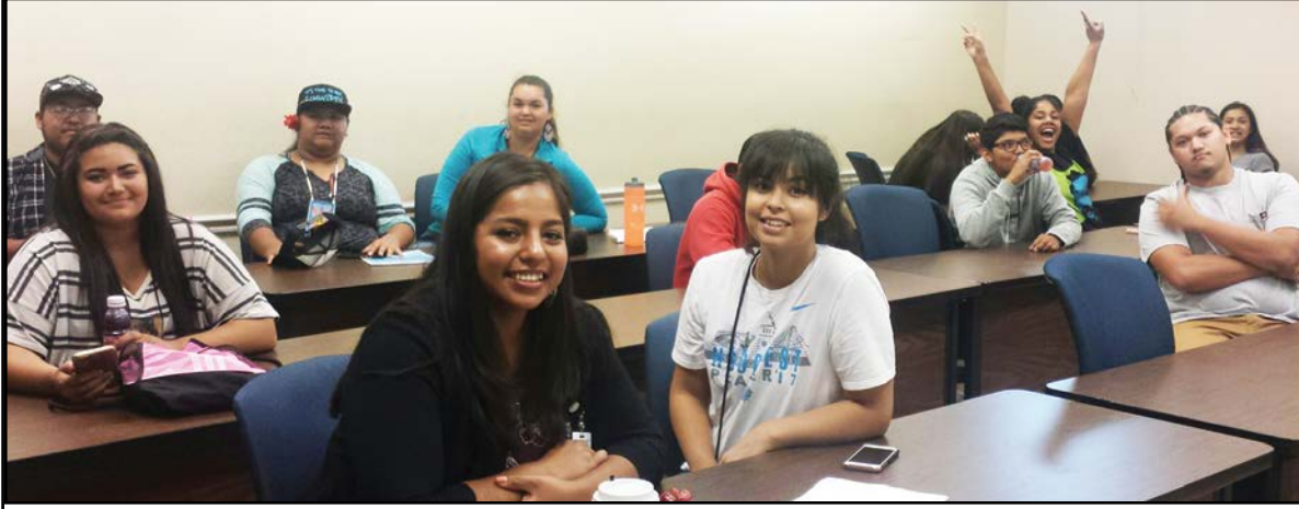
Students and staff participated in a 3 day summit that was jam packed with information.