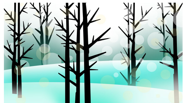
Christmas pictures from online unknown services